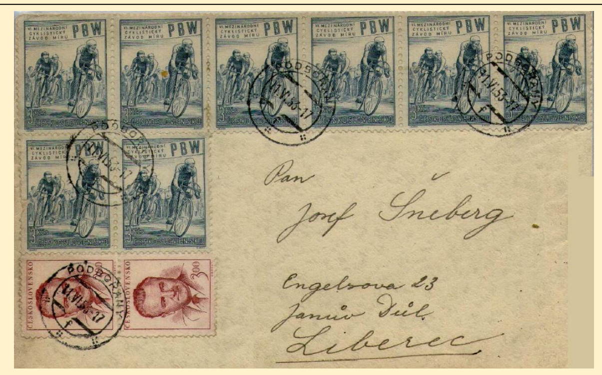
Czechoslovakia (1953). Letter used on 11/07/1953 during the transition period from the time the monetary reform was declared until the new stamps were issued. Non-local letter (circulated from Podborany to Liberec) up to 20g, with a rate of 3Kcs before the reform, but during the reform need to be franked with old 30Kkcs, which was equivalent to 0.6Kcs (30: 50 = 0.6). Right postage. RARE.

In 01/06/1953, Czechoslovakia declared a surprise drastic currency reform as a response to the black market that devalued the current Koruna (Kc) by a factor of 50:1. New banknotes, printed in the Soviet Union, were issued that day. However, the postal system was not ready and had no new stamps under the new currency until 19th June. At the same time, postal rates were all adjusted and the face value postage rate was 1/5 of the previous rate (in practice, 10 times the previous face value during the transition period). For example, the rate for local mail before 1st June was 2 Kcs, between 1st-18th June was 40 helles (40 h, 2 1/5 Kcs, where 1 Kcs = 100 h) and after 19th June 20 new Kcs (equivalent to 50 times old Kcs). On 19th June new stamps were issued and old ones were not valid.