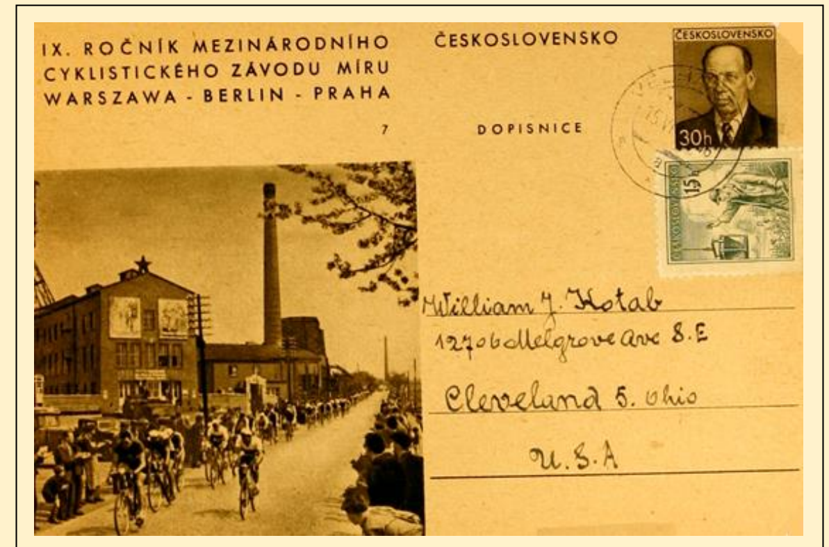
Czechoslovakia (1956). Set of 8 stationary cards, all devoted to the Peace Race. Sent to USA, 30h inland stationary card uprated to 45h. After the monetary reform the postal rate was 45h (0,45Kcs) for international mail. Right postage.