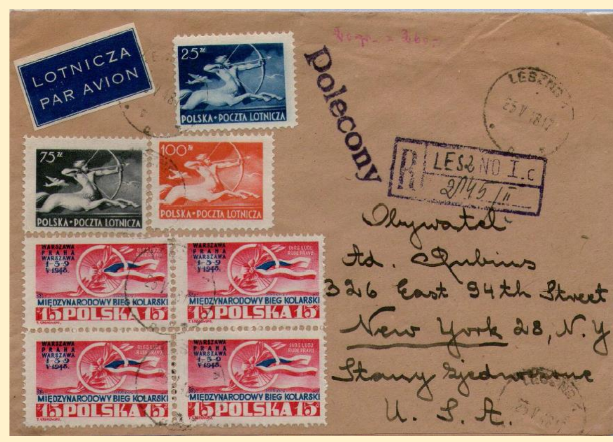
Poland (1948). Registered airmail letter from Poland to USA, franked with 4 stamps of Polish 1st issue of The Peace Race and additionally up-rated with 3 airmail stamps. Used on 25/05/1948.

The Peace Race or La Course de la Paix , also known as PWB (Prague-Warsaw-Berlin), Friedensfahrt (in Germany), Závod míru or Preteky mieru (in Czechoslovakia), Велогонка Мира (in Russia) or Wyścig Pokoju (in Poland), was an annual multiple stage bicycle race held in the Eastern Bloc states of Czechoslovakia, East Germany, and Poland. First organized in 1948, it was originally created with the intent of relieving tensions existing between Central European countries following the interwar period and WWII. It was known as Le Tour of East and for long time was most important amateur race.