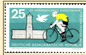
The fall of communism in 1989 professionalized the race, but quickly succumbed to the difficulty of finding sponsors and be relevant in the European calendar of the UCI.