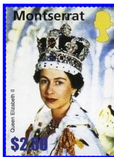
2006, 80th birthday, lithography