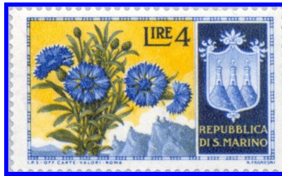
Commemorative, 1953, photogravure.

A recent article in the New York Times reported that all over the world blue is the most favored color. When I received a beautiful sapphire ring, it led me on a quest to find out more about the gemstone that is the gorgeous shade of blue we often call cornflower.