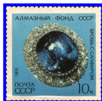
USSR, 1971 lithography