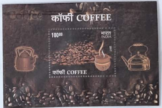
Multi Colour Wet Offset SPP Hyderabad