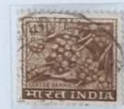
Definitive 4th series Coffee 4ps 1968